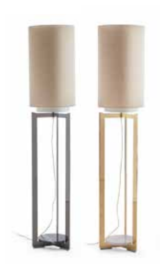
Toni cm. ø 33x162